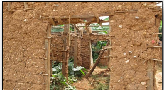
Above: New home being constructed using branches and mud. Below: Home of destitute woman receiving help from Michael's House. Her house has a good roof that helps carry water away from the walls.