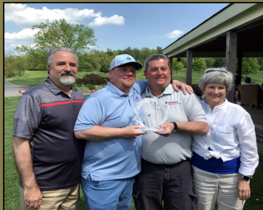
Left: Whiskey Creek Golf Course.